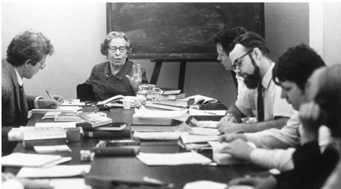
Hannah Arendt teaching at the New School for Social Research.