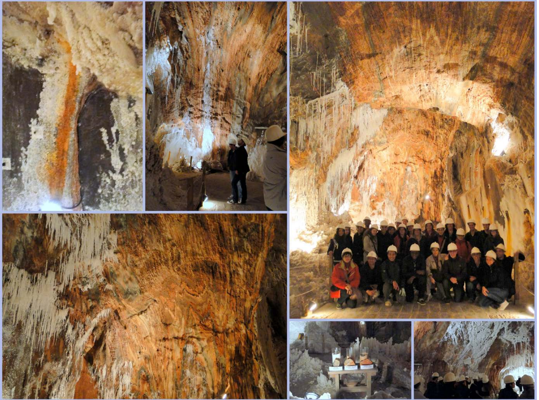
Cultural visit at Cardona mines