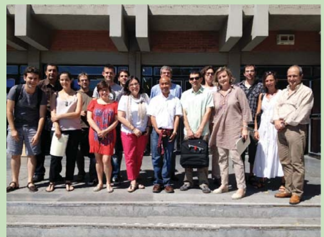
Barcelona Insurance and Risk Management Summer School 2012