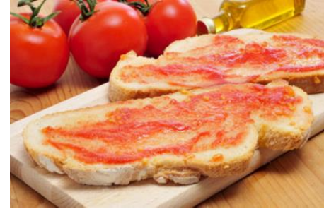
Pa amb Tomàquet