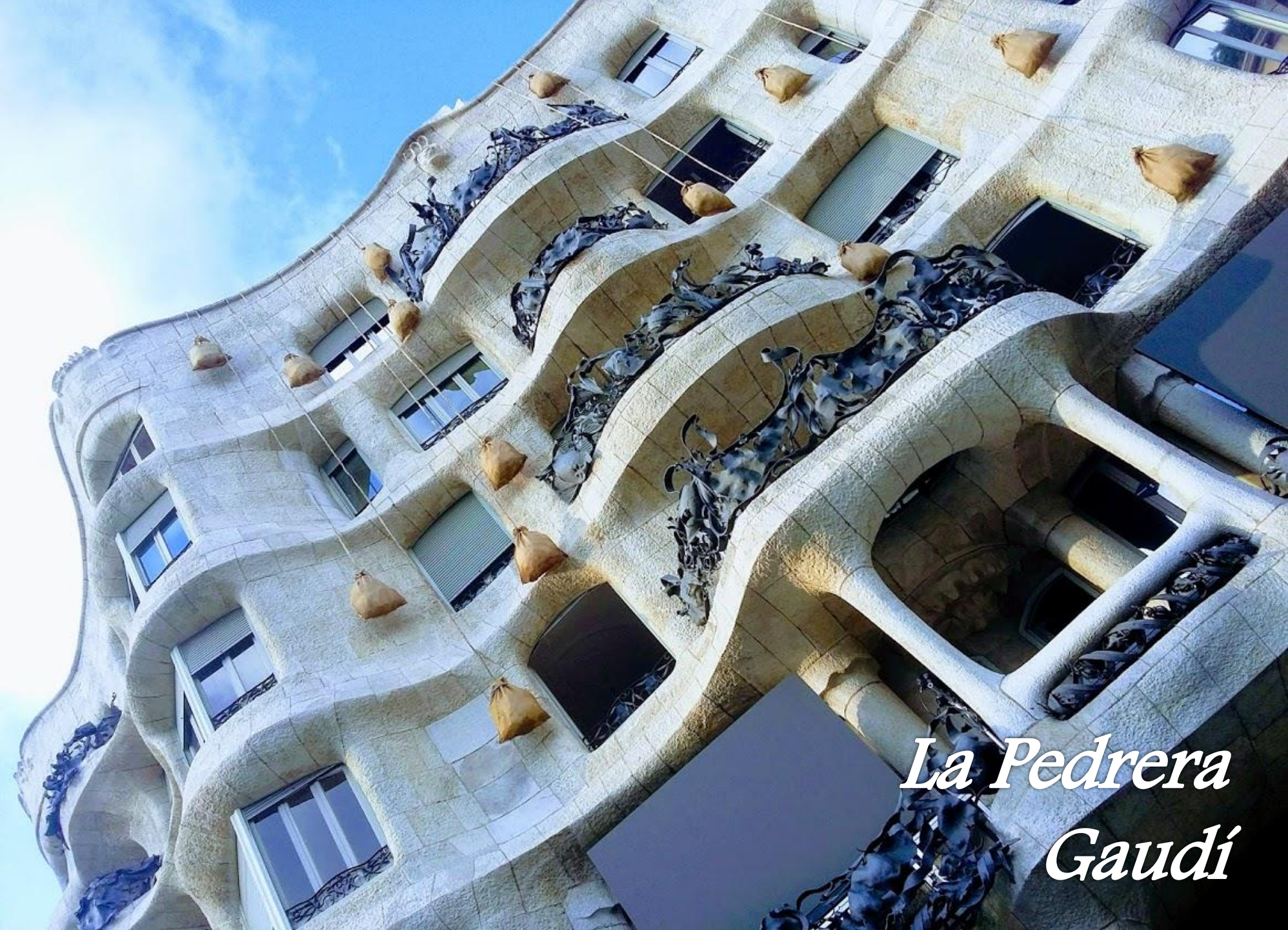
La Pedrera Gaudí