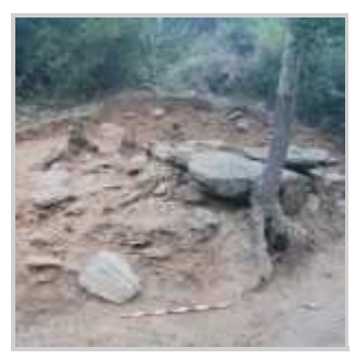
dels Tres Pagesos (September with permission