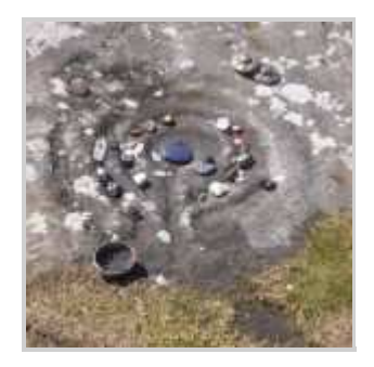
5. Charging crystal sat Roughting Linn rock art site, 31 May 2009.