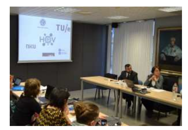
Photo 3: Joan Pluma, the General Director of Archives, Libraries, Museums and Heritage of the Government of Catalonia

There were five discussion lines during the workshop: Inclusivity; Participatory and Sustainable Heritage; Virtual Heritage, Heritage Values and the Public; Tourism; and World Heritage. The two-day event was inaugurated by Joan Pluma, the General Director of Archives, Libraries, Museums and Heritage of the Government of Catalonia (Generalitat de Catalunya) (Photo 3). It included a combination of papers (Photo 4), round tables (Photos 5-6), activities, discussions and debates. Among the activities, the two voted as most successful were a politics slam role-play (Photo 7) and a heritage tour of the Gothic Quarter of Barcelona (Photos 8-9). In the latter, small groups of participants had the task of discussing the city's heritage and its relationship with both tourists and local residents. Thus signposts, playgrounds, use by schools, special attention to particular communities and gentrification were considered and discussed. A video explaining the process of the Rua Xic project was followed by a discussion with members of the Marabal Cultural Association that ran the project (Photo 10) and in which members of GAPP had a key role. This contrasted with the more theoretical discussions based on information provided in the papers given by speakers working in the academic and non-academic heritage sectors. The participants were from the areas of tourism, commercial archaeology, museums, state agencies, state and regional departments and universities.