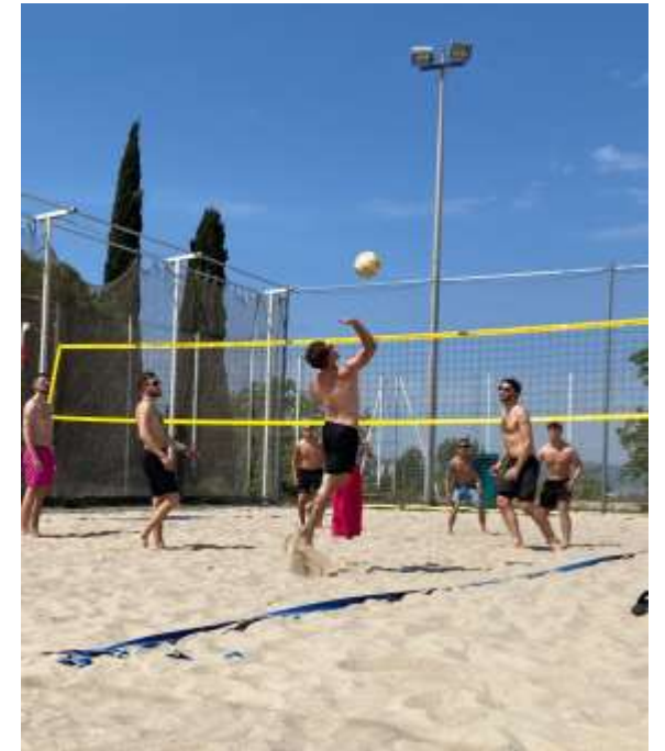
Volley tournament (May 2023)