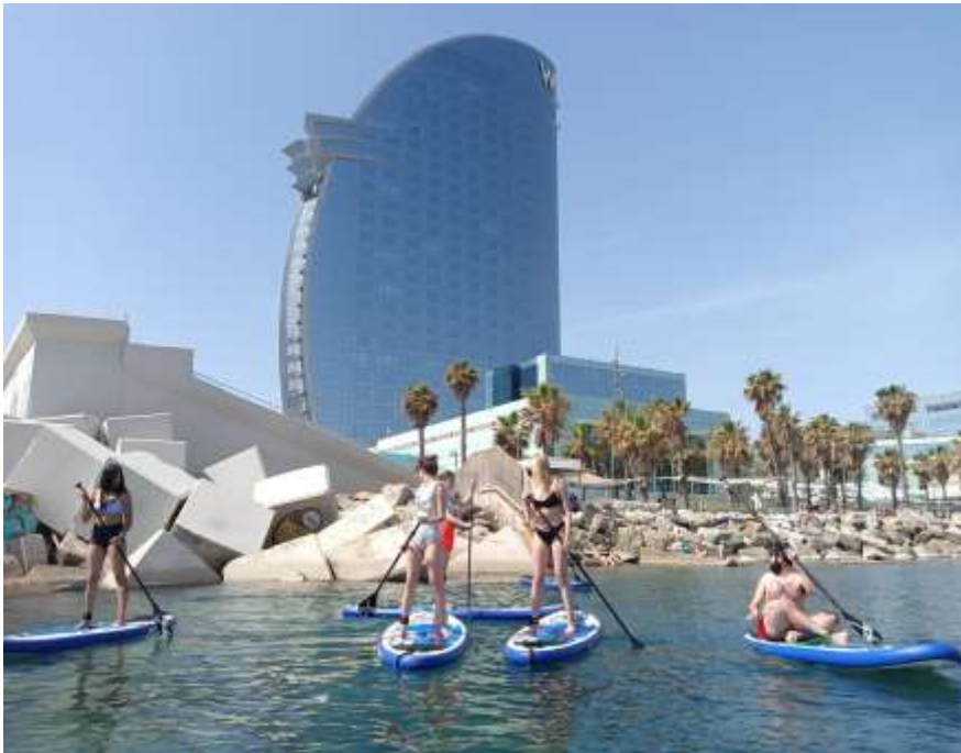
Paddle surf (May 2022)