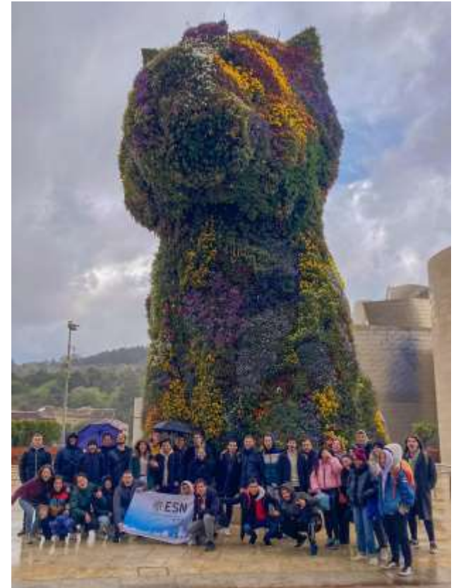
Euskadi (April 2023)