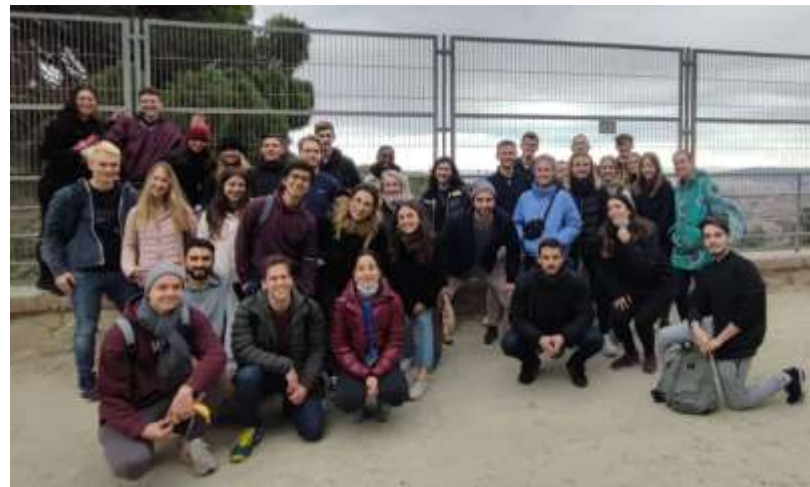
Trekking Tibidabo (Feb 2023)