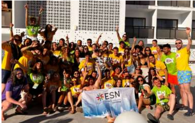
ESN Ibiza Trip (April 2023)