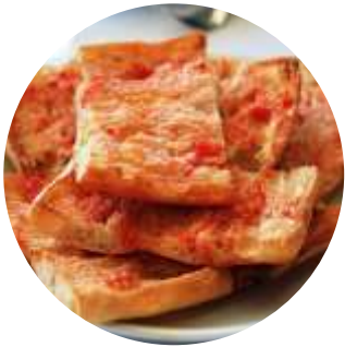
pa amb tomàquet