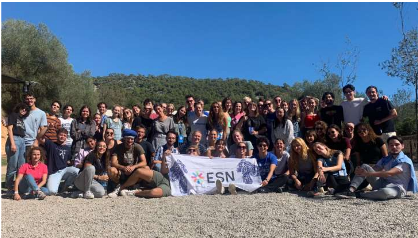
Integration Weekend (Oct 2022)