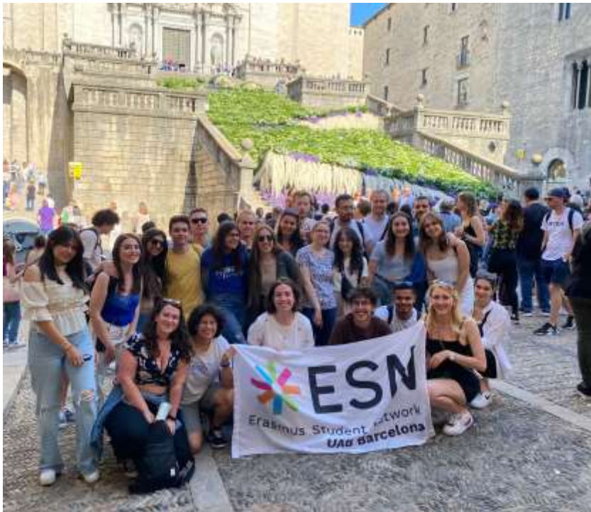
Girona Temps de Flors (May 2023)