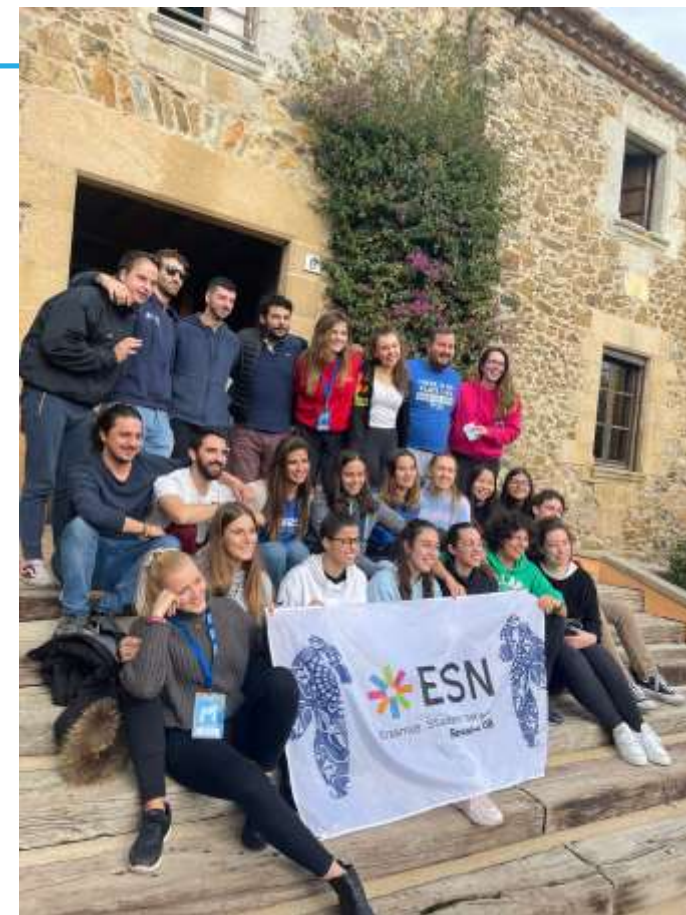
Integration Weekend (Nov 2021)