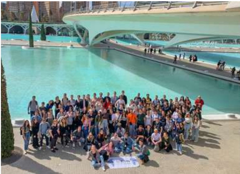
Valencia (March 2023)